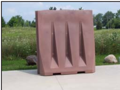
G. Can be moved with a forklift