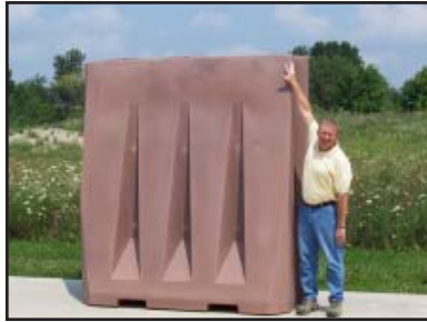
D. Sand Weight is 12,500 lbs