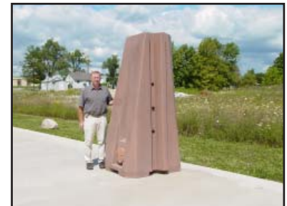
F. Corner for 90 degree angles