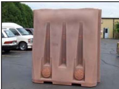
H. Dumps for ballast removal

Please note that this brochure is still in development.