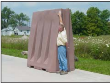
C. Empty Weight is 425 lbs