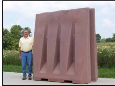
B. Dimensions are 96" x 7'