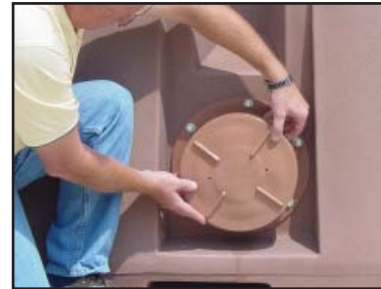
A. Sand Dump screws off