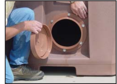
B. Fast Removal of Ballast