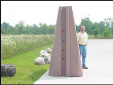
E. Superior strength supports