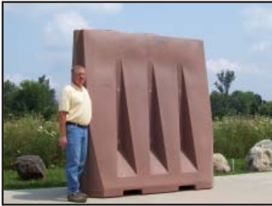
A. 967 High Threat Barricade