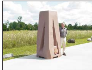
F. Corner for 90 degree angles