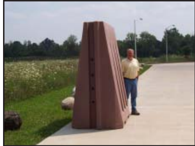
F. Designed to stand side-by-side