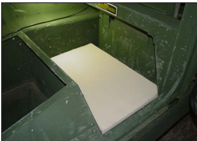
Right rear passenger foot pad.