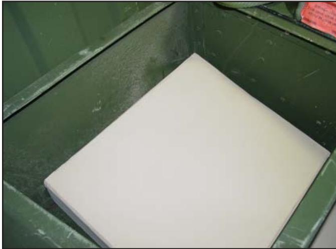
Left rear under passenger seat.