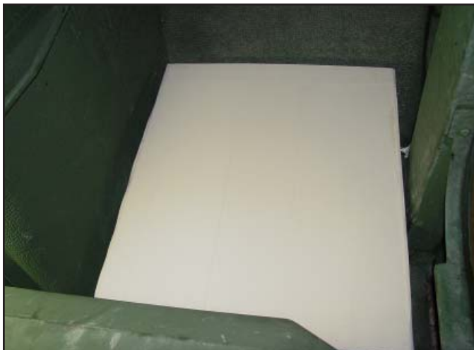
Right front passenger floor pad.