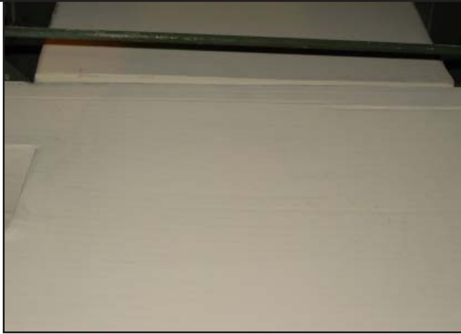
Under Drivers seat and left rear passenger floor pad