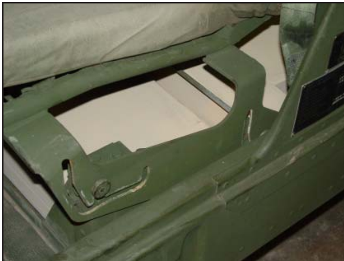
Under drivers seat and floor pad of right rear