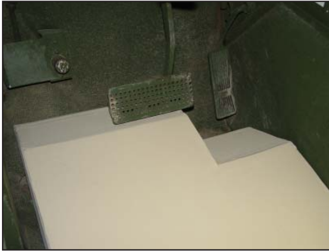
Drivers Foot Pad