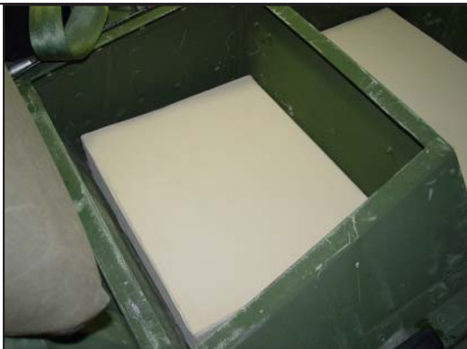
Right rear passenger foot pad and under seat.