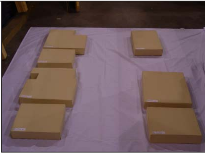
One set of the Shrapnel Attenuator includes seven individual pieces specifically designed and molded to fit into a four person military Hummer