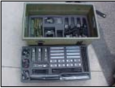
A. B2-1 Box Complete Set