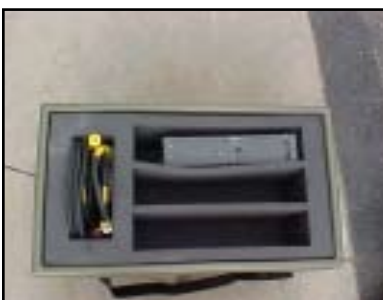
D. BS-4 Box Complete