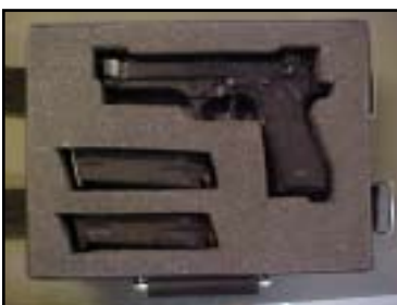
E. 9mm Personal Weapons Case