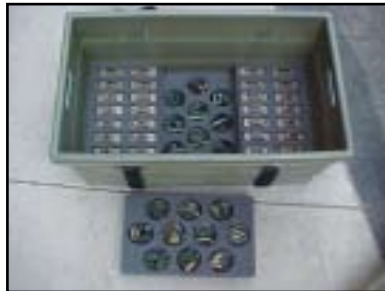
B. MIDS Box Top Layer