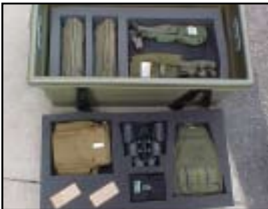
A. BS-3 Box Complete Set