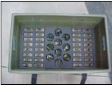
A. MIDS Bottom Layer