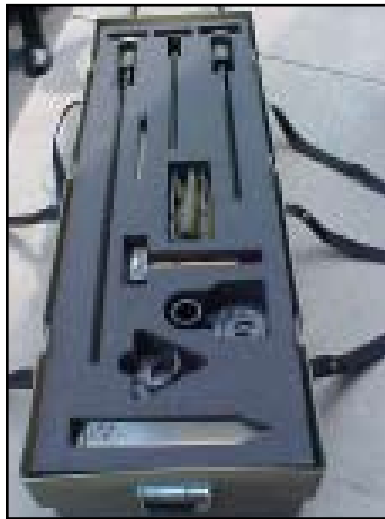
A. Antenna Mast Top Layer