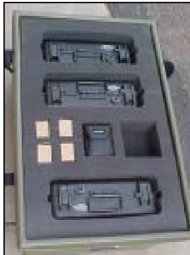
B. B2-3 Box Complete Set