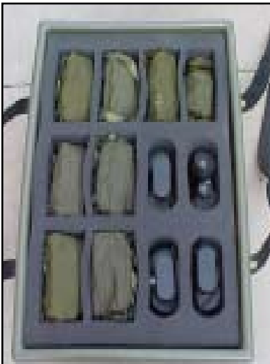
A. B2-2 Box Complete Set