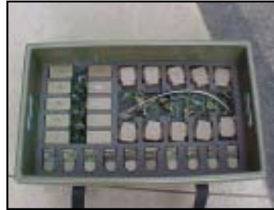
F. MIDS Box Middle Layer