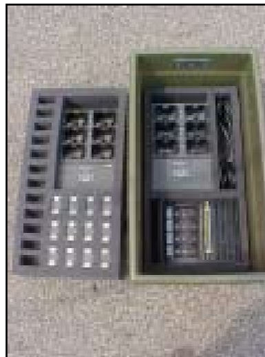
A. BS-1 Box Complete Set