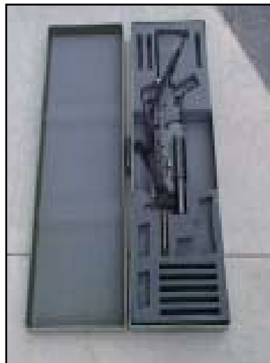
D. 203 Personal Weapons Case