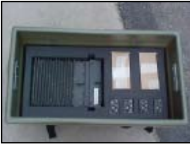
F. BS-2 Bottom Layer