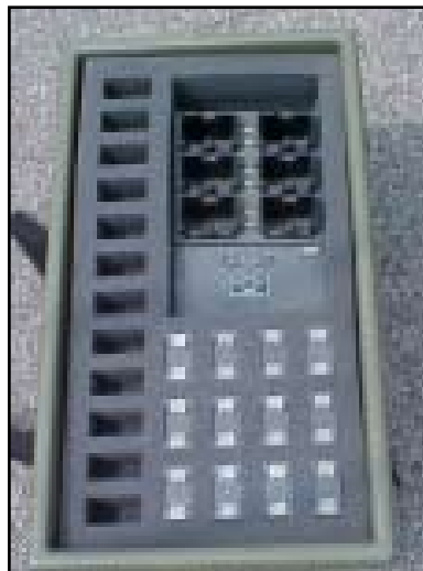
B. BS-1 Box Top Layer