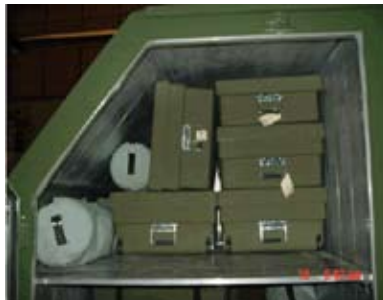
E. Plastic Box for Garrett Container