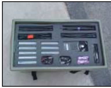
E. BS-2 Top Layer