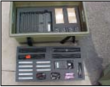
D. BS-2 Box Complete Set