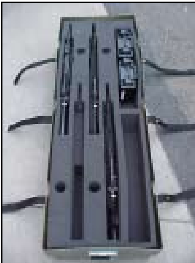
C. FT4 Box Complete Set