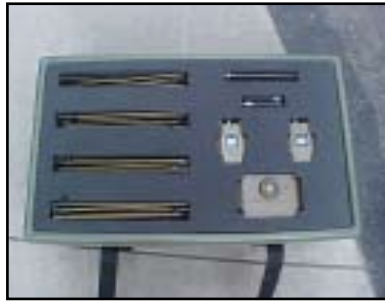
E. MIDS Box Top Layer