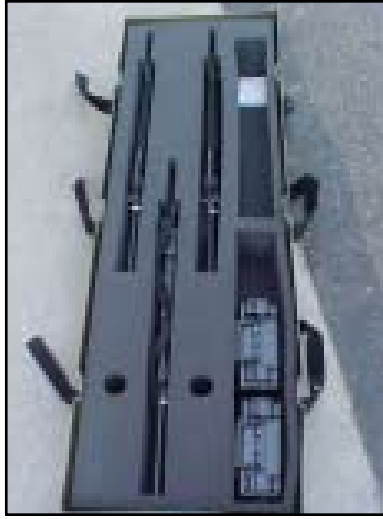
E. FT-2 Box Complete Set