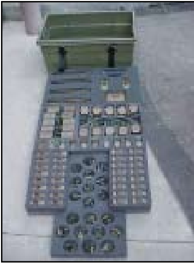
D. MIDS Box Complete Set