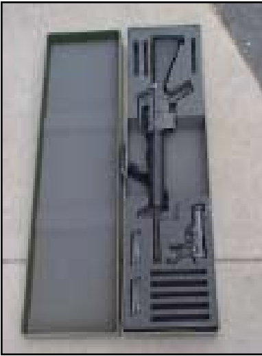
A. Ravens Weapon Box Top Layer