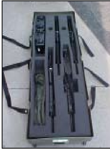
B. FT3 Box Complete Set