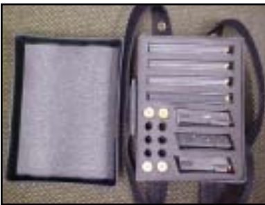
C. Ravens Ammunition Kit