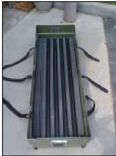
B. Antenna Mast Bottom Layer