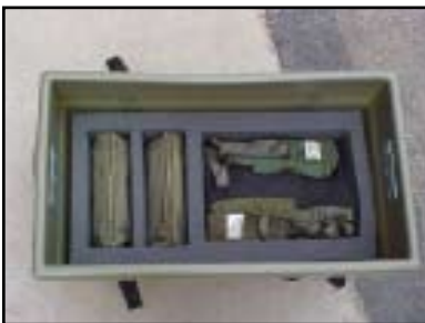
C. BS-3 Bottom Layer