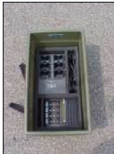
C. BS-1 Box Bottom Layer