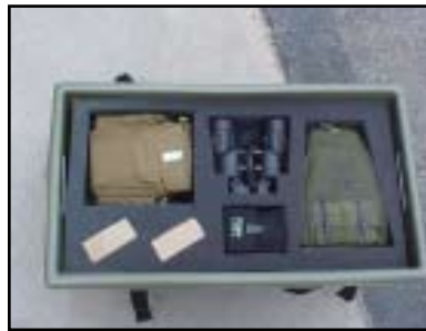
B. BS-3 Top Layer