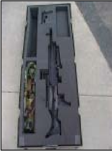
A. FT2-2 Box Complete Set