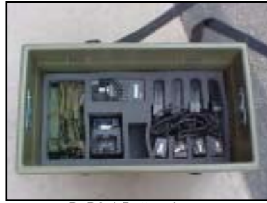
B. B2-1 Bottom Layer