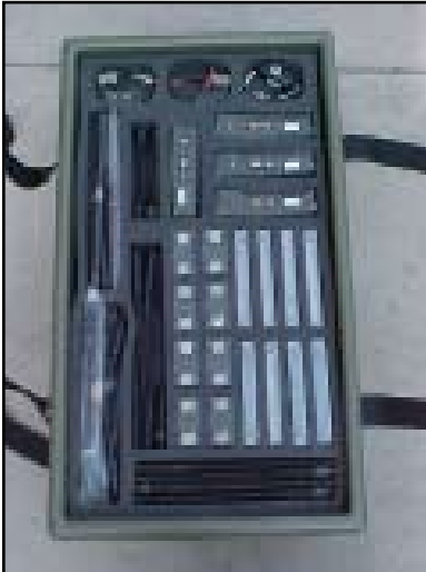
C. B2-1 Box Top Layer