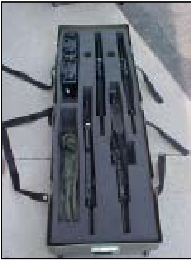
D. FT-1 Box Complete Set