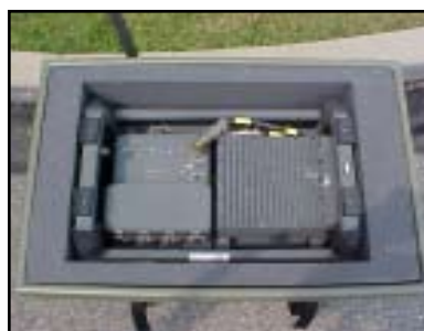
E. BS-5 Box Complete