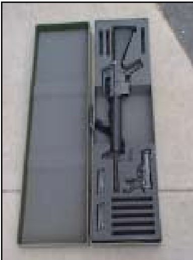
C. M16 Personal Weapons Case