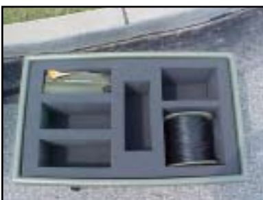
C. B2-4 Box Complete Set