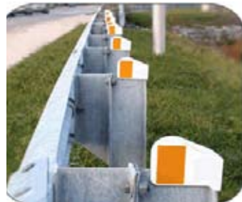
C. Pedestrian Walkways